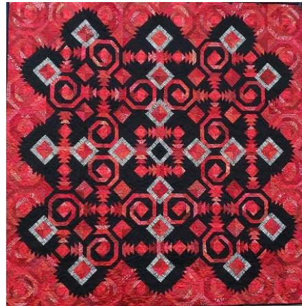
..... Ruby slipper pillow from the last scraps of red!!

The 2022 Opportunity Quilt was unveiled at the November Guild meeting. "Ruby Whirlwind" is an 80"x80" quilt, made up of 64 pineapple blocks.