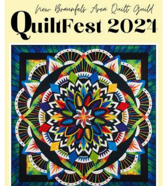
"Peace, Love, & Flower Power" July 26-27, 2024

http://www.newbraunfelsareaquiltguild.org/quiltfe st-2024.html